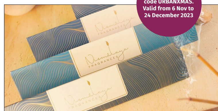
THE MEDITATION COLLECTION/URBAN UTSAV