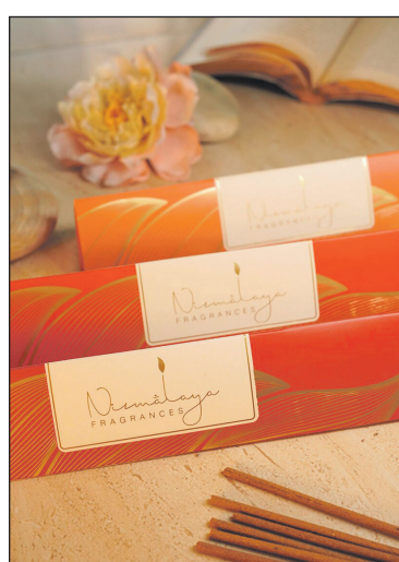
THE ITTAR COLLECTION/URBAN UTSAV