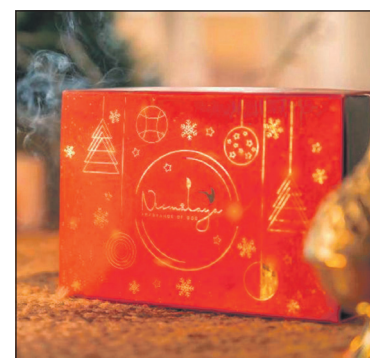
CHRISTMAS GIFT SET/URBAN UTSAV

Urban Utsav has established strong partnerships with artisans, entrepreneurs, social enterprises and manufacturers from Southeast Asia to curate a collection of unique, ethically sourced and sustainable festive and gifting products.